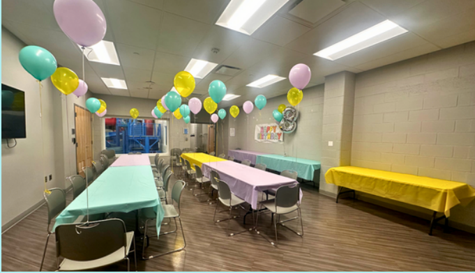
POOL VIEW ROOM