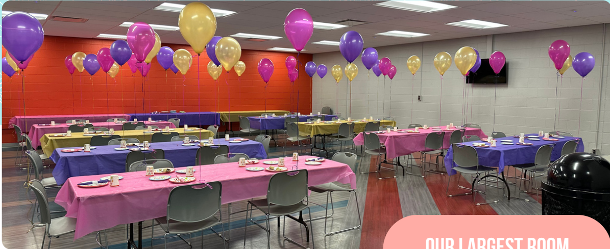
OUR LARGEST ROOM

Celebrate your birthday like never before with our double room! Our spacious room is perfect for a fun-filled party with friends and family. With two rooms attached, you can spread out, play games, and make lasting memories. Room capacity is 45 people.